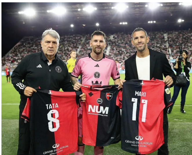
Lionel Messi (centre) with Argentinean coach Gerardo "Tata" Martino (left) and Maxi Rodriguez (right) holding Newell's Old Boys shirts.

The statue of Isaac Newell should not be considered a celebration of football; it will be a chance to educate Medway's community, an inspiration to the children and young people of Medway; a celebration of the life and legacy of a legend from Medway; and a focal point in Medway for visitors from around the world.